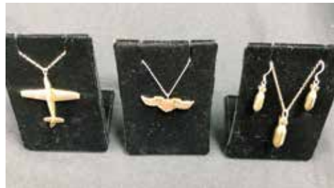
Custom jewelry made by Portsche's Fine Jewelry out of warbird brass fittings.