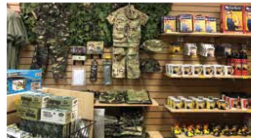
Camo and Rosie the Riveter items for everyone in the family.