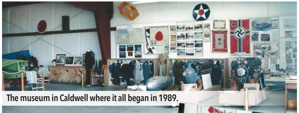
The museum in Caldwell where it all began in 1989.

Help a friend visit the museum with this BOGO coupon