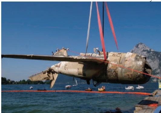
Above: Dottie Mae being recovered from the lake in Austria where she went down in 1945