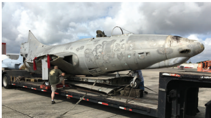
Our new Panther arriving!

warhawkairmuseum.org/giving/restoration-project/