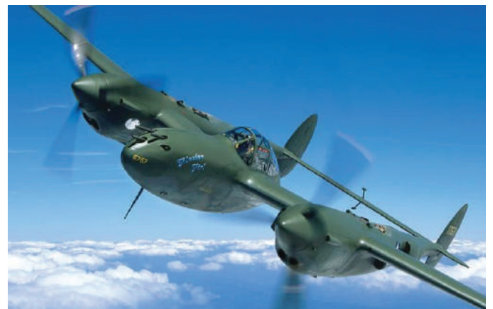
Warhawk Air Museum Summer Newsletter 5