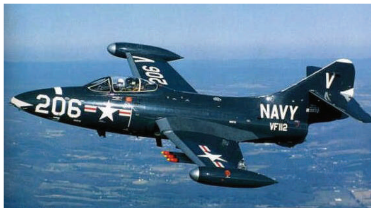
Possible paint scheme?