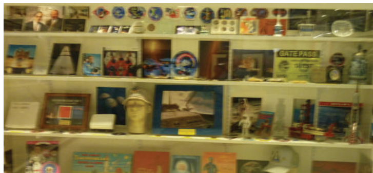
Cabinet 178: Comprised of items from the 14 donors. Included are tile from the space shuttle and a parachute piece from the Orion capsule.