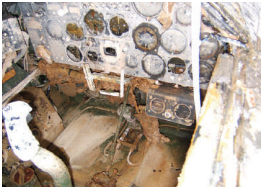
Left: Dottie Mae's cockpit after recovery