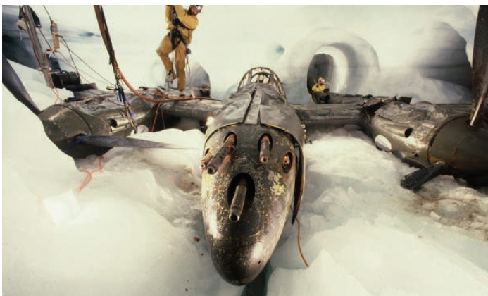
Glacier Girl buried in the ice during recovery efforts

Below: Glacier Girl fully restored and flying